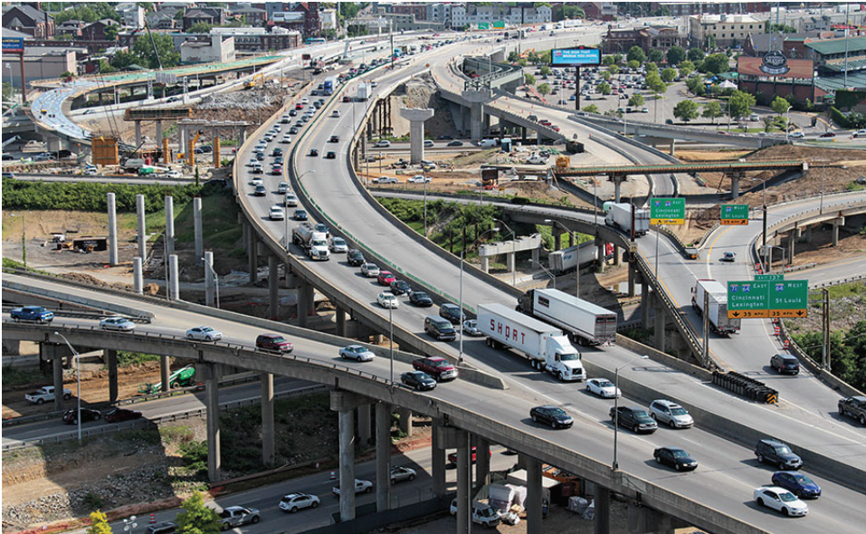
The multiyear bill holds the promise of certainty after a frustrating series of stopgaps.